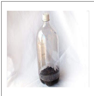
Kids will love helping make and take care of a terrarium.